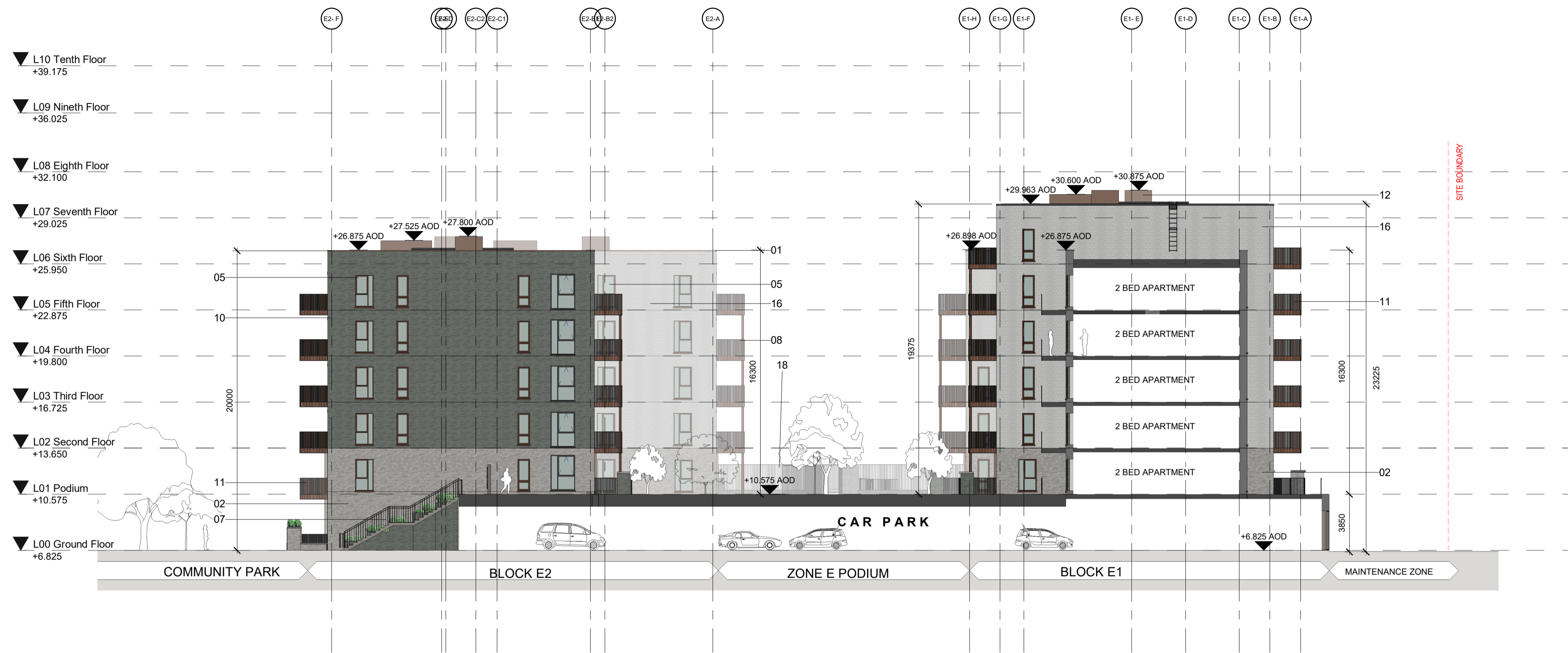
1 BLOCK E1/2 - SECTION/ELEVATION FACING NORTH 1:200